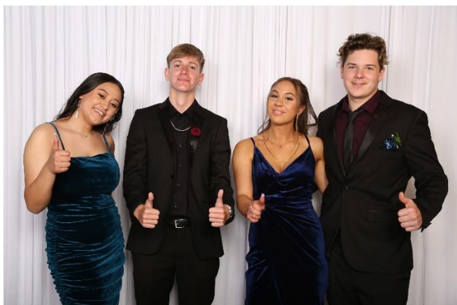
College Sport Wellington Sports Person of the Year Award attendees.