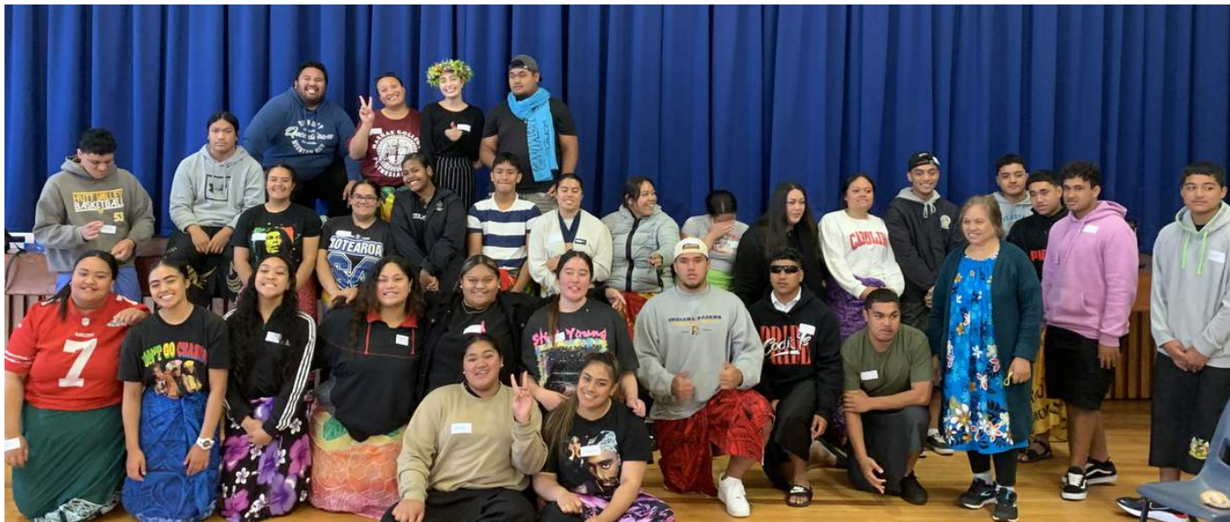
Photo Caption: Poly Club Student leaders from Naenae College, Heretaunga College, Upper Hutt College, Sacred Heart College, St Bernard's College, St Pat's Silverstream, and Hutt Valley High.

Our Poly Club hosted the Hutt Valley Secondary Schools Poly Club Leadership and Dance workshops on Saturday 13 March in our school hall.