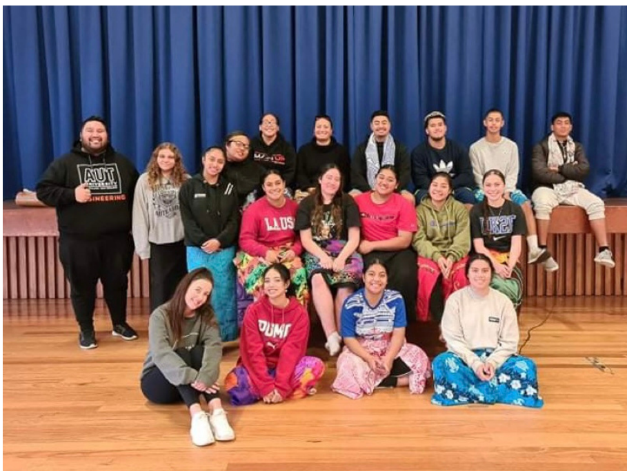
Poly Club Student leaders from Naenae College, Upper Hutt College, Taita College, Makoura College