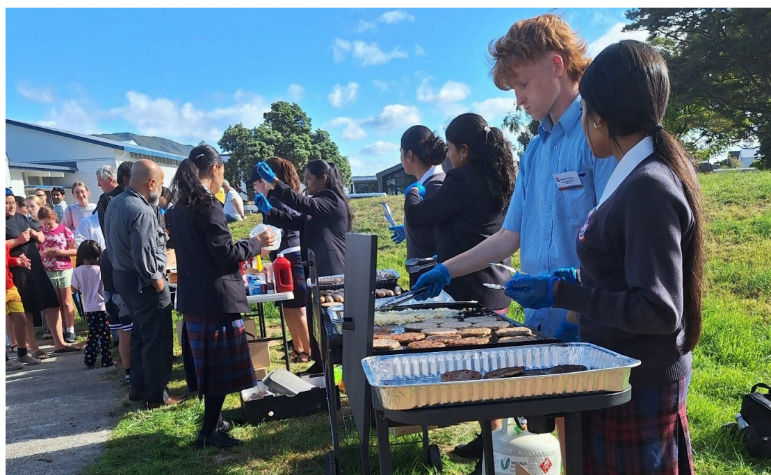
YEAR 9 WHANAU WELCOME EVENING