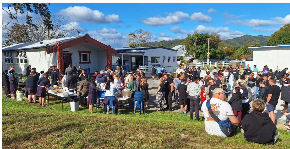
YEAR 9 WHANAU WELCOME EVENING