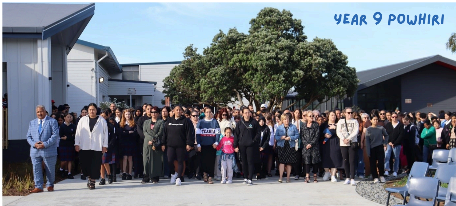
YEAR 9 POWHIRI